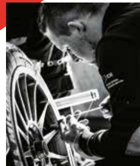
The mechanics :